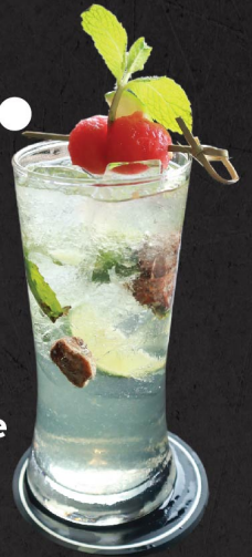
Lemon Lime Ume