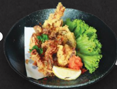
Soft Shell Crab