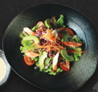
Kani Avocado Salad