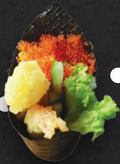
Ebi Tempura Temaki