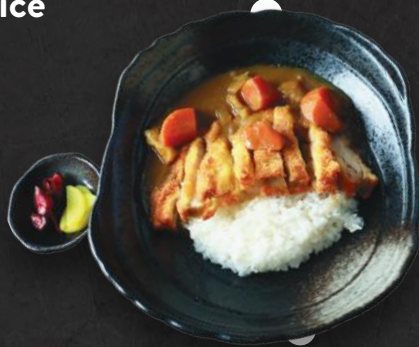
Chicken Katsu Curry