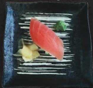
Red Tuna Sushi