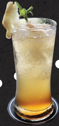
Hiyashiame Sweet Ginger