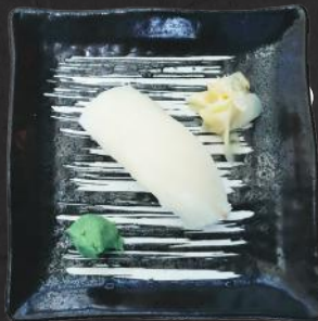
White Tuna Sushi