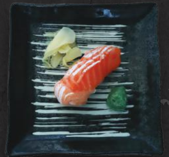
Salmon Belly Sushi