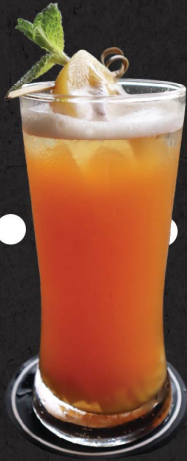
Peach Ice Tea