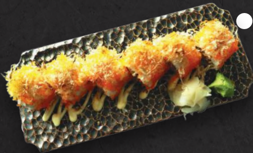
Spicy Salmon Roll