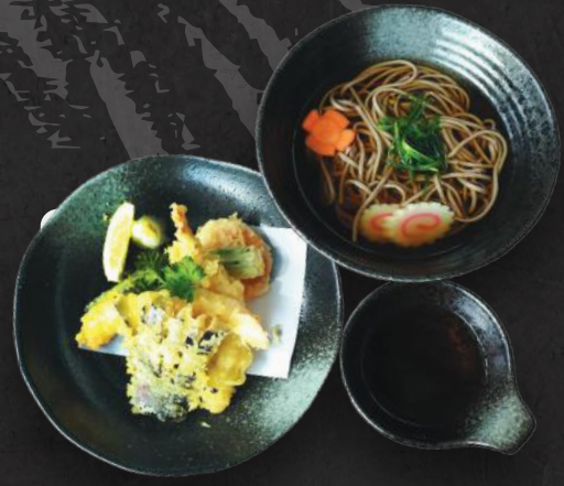
Tempura, Soba & Udon