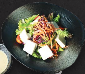
Kaiso To Tofu No Salad