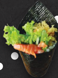
Spicy Salmon Temaki