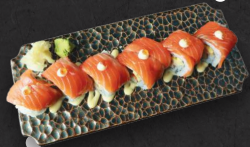
Salmon Coral Roll