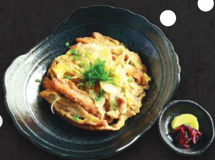
Chicken Katsu Don