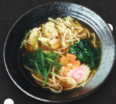
Shoyu Shio Ramen