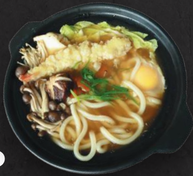
Nabeyaki, Udon & Soba