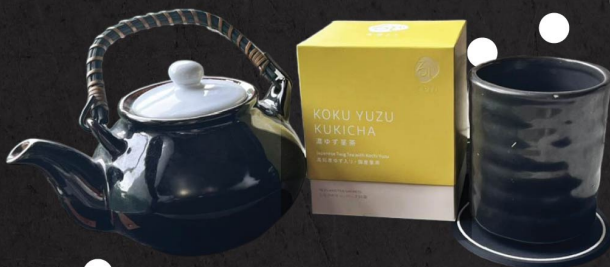
Koku Yuzu Kukicha