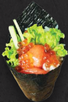
Sake Ikura Temaki