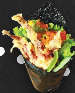
Soft Shell Crab Temaki