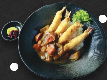
Ebi Furai Curry