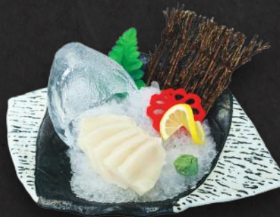
White Tuna Sashimi