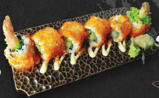
Ebi Tempura Roll