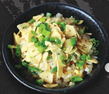
Garlic Fried Rice